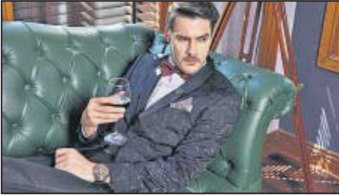
(Above and below) Models displaying Cantabil's collection

A renowned name in the high fashion segment of menswear, womenswear, and kidswear, Cantabil takes inspiration from fashion trends across the globe. Their design aesthetic is in sync with urban fashion.